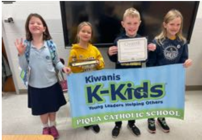
left to right: President, Secretary, Treasurer, Vice President.

The Piqua Catholic K-Kids club elected their first slate of officers at their Charter meeting. Newly elected officers are pictured below with their club's certificate of Charter and official banner.