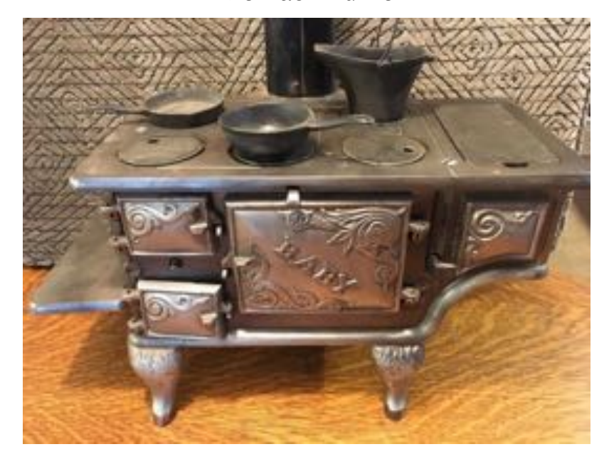
The Back Burner

Just a few things on the back burner that are worth noting: