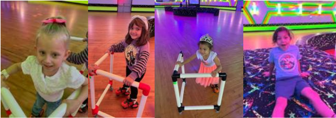
Above, special needs children "hit the skate floor". The one on the right literally hit the floor!

The event was held at 36 Skate Club in Piqua and judging from the pictures below was the perfect venue for a great evening!