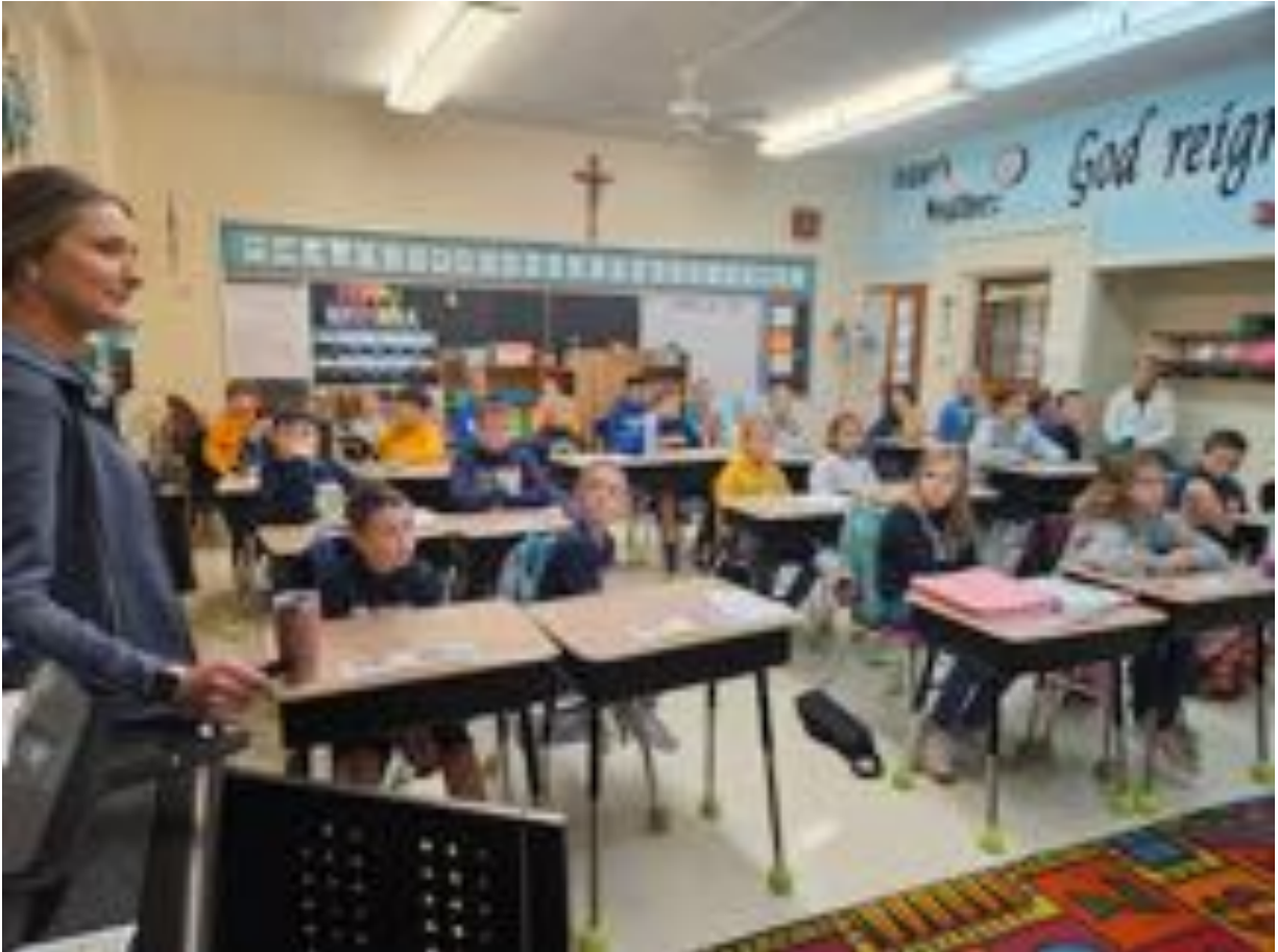
Pictured above are twenty-five "early birds" who turned out for the 7:30 meeting.

Look for election results in next month's newsletter!