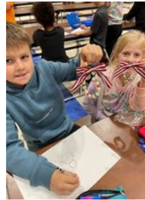
Springcreek K-Kids, above, are hard at work making placemats for Meals on Wheels, creating sensory pads to help children practice small motor skills, and cranking out ornaments to take home!