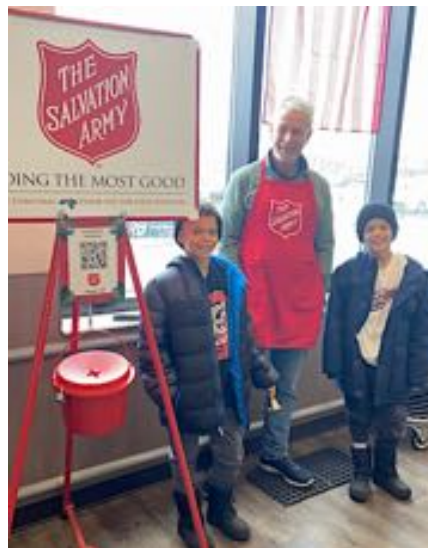
Two Washington K Kids help ring bells at Kroger while their mother shopped!