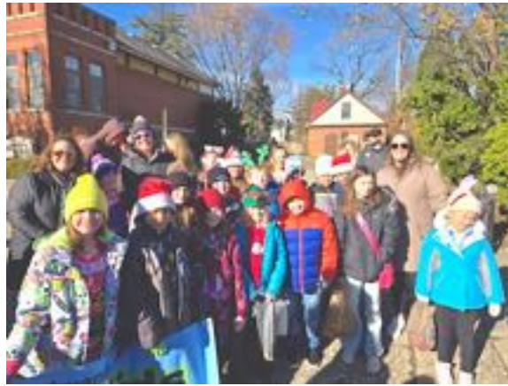
Washington K-Kids are pictured above enjoying the Holiday Parade this past December 7th.